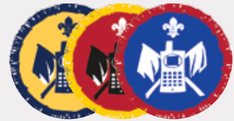
Beaver, Cub and Scout Communicator Activity Badge