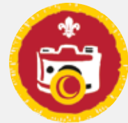
Cubs Photographer Activity Badge