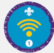
Digital Citizen Badge