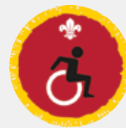
Cubs Disability Awareness Activity Badge