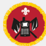
Cubs Communicator Activity Badge