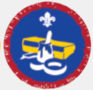
Scout Craft Activity Badge