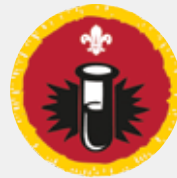
Cubs Scientist Activity Badge