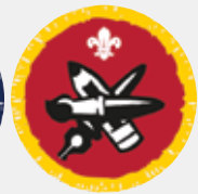
Cubs Artist Activity Badge