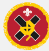
Pioneer Activity Badge