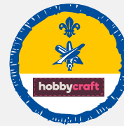
Beaver Creative Activity Badge