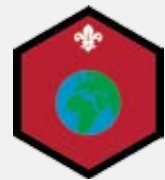
Beaver My World Challenge Award