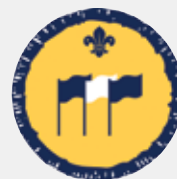
Beaver International Activity Badge