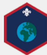
Scouts World Challenge Badge