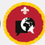
Cubs Global Issues Activity Badge