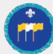
Explorer International Activity Badge