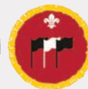
Cub International Activity Badge