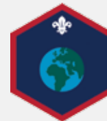
Scout Our World Challenge Award