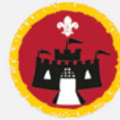
Cubs Local Knowledge Activity Badge