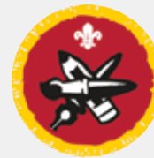
Cubs Artist Activity Badge