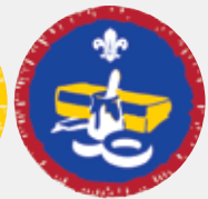
Scout Craft Activity Badge