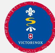
Scout Survival Skills Activity Badge