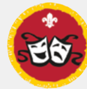
Cubs Entertainer Activity Badge