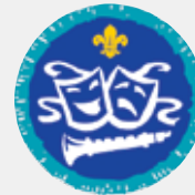
Explorer Performing Arts Activity Badge