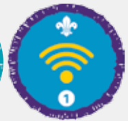
All Digital Citizen Staged Activity Badge